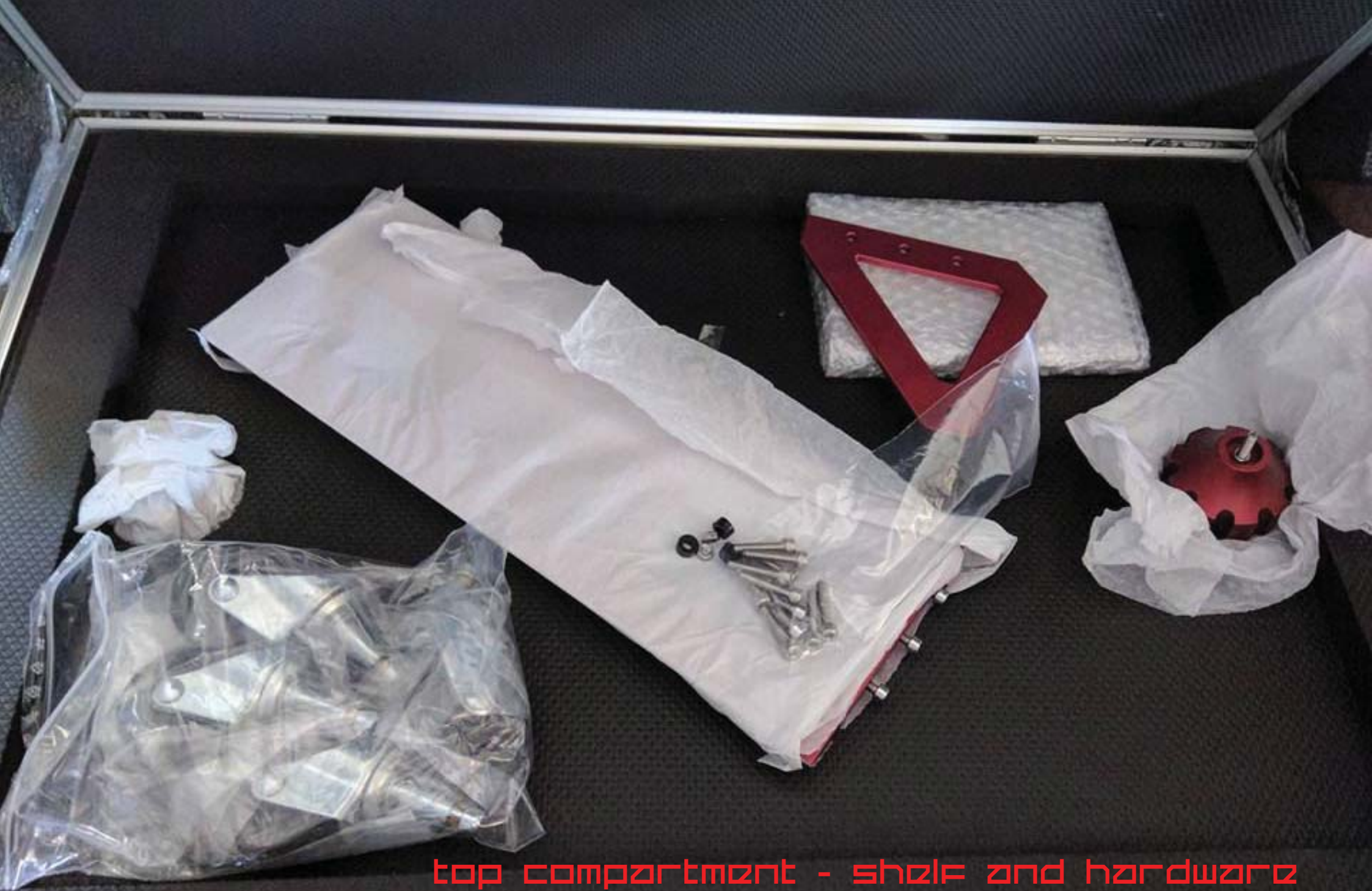
top compartment - shelf and hardware