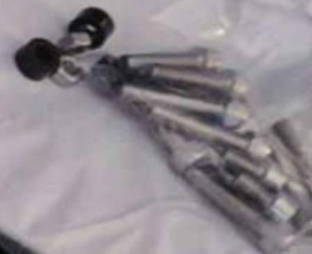
bag with 4 rollers